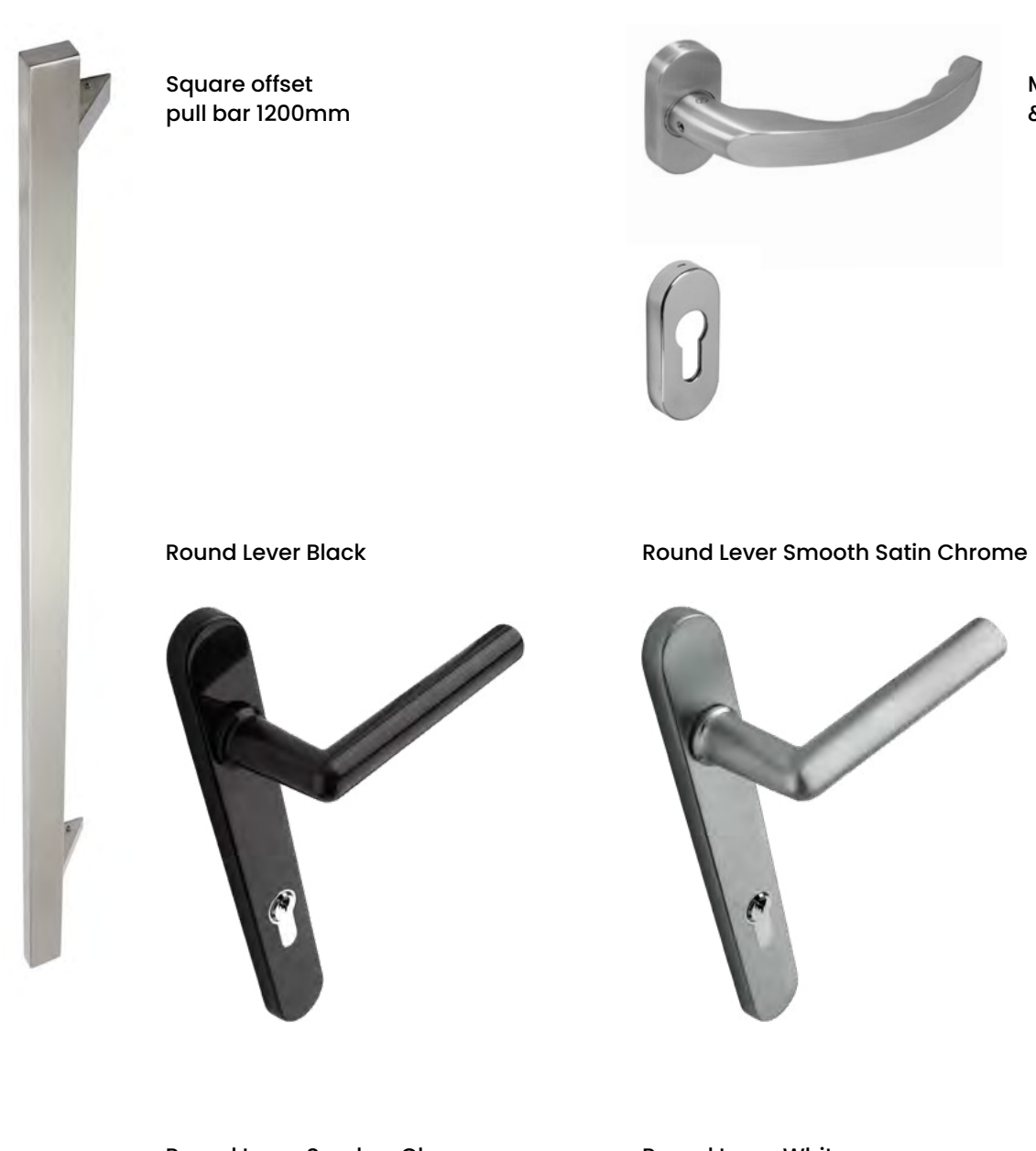
Round Lever Smokey Chrome