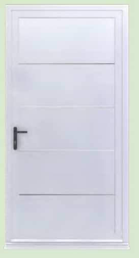
SANDRINGHAM door with smokey chrome handle