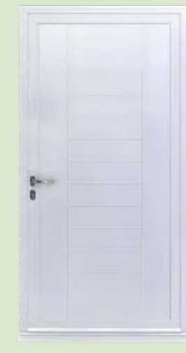
BALMORAL door modern handle