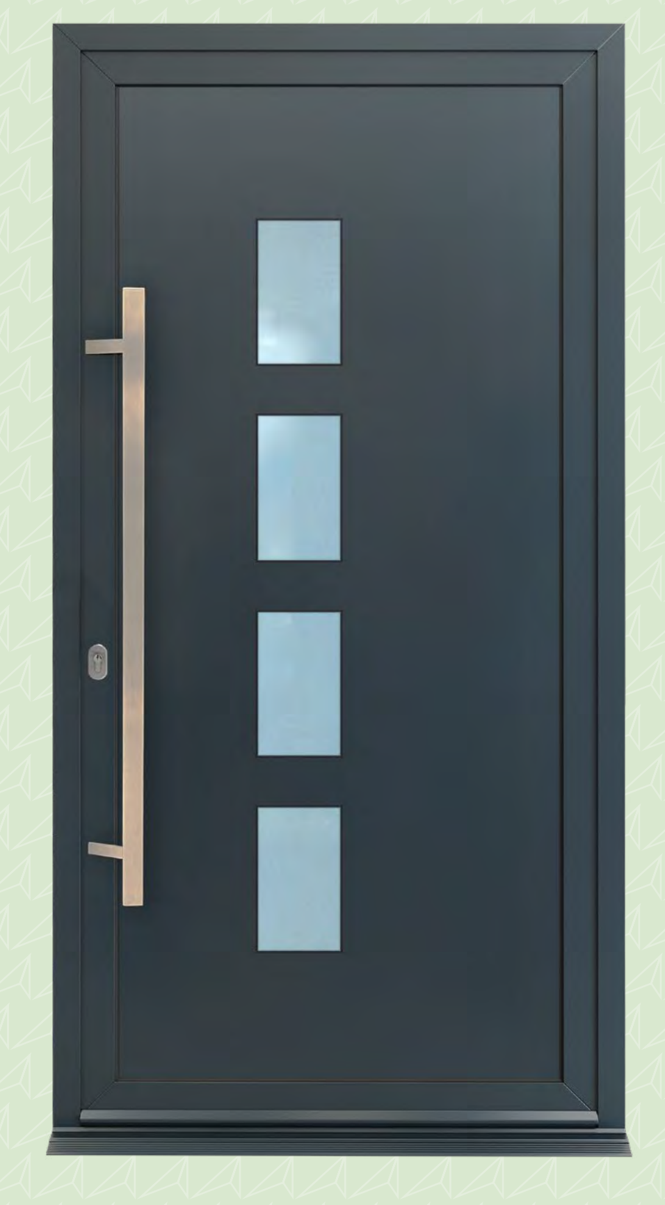
We can offer a 5 day turnaround on 5 of the doors from our range*